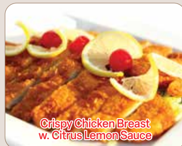
Crispy Chicken Breast w. Citrus Lemon Sauce

Scoring of one to four stars indicates impression of food, service, ambiance and value.