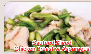
Sauteed Sliced Chicken Breast w. Asparagus