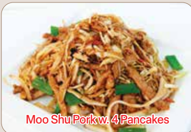
Moo Shu Pork w. 4 Pancakes