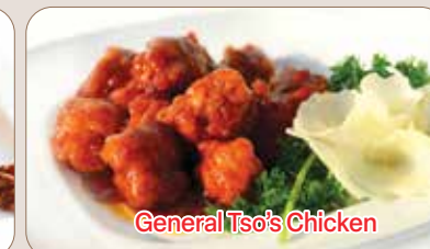
General Tso's Chicken