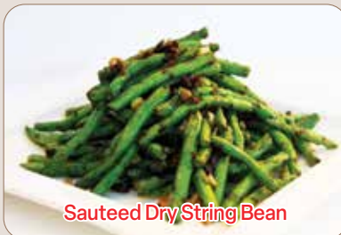
Sauteed Dry String Bean