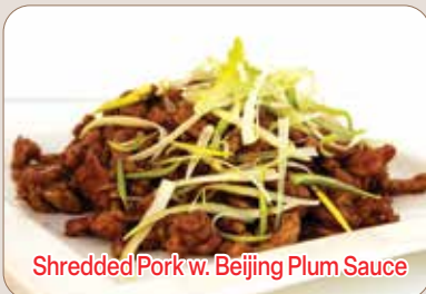
Shredded Pork w. Beijing Plum Sauce